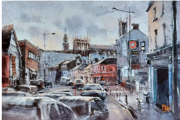
1. Watercourse Rd., the view to St. Mary Cathedral and Shandon, Blackpool, Cork, Watercolour on paper, 31x23 cm, Winter 2023 €370 Framed