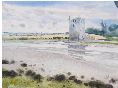
4. Low tide in a sunny day, Belvelly castle (Plein air), Watercolour on paper, 31x23 cm, Summer 2023 €370 Framed