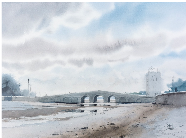
3. Belvelly Bridge and Castle (Plein air), Watercolour on paper, 31x23 cm, Summer 2023 €380 Framed