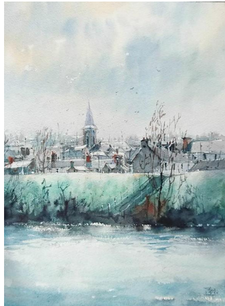
8. Blackwater River in Fermoy, Watercolour on paper, 41x30 cm Winter 2023 €320 Framed