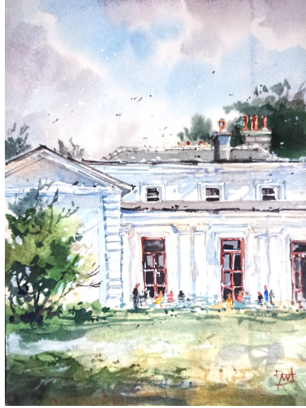
12. Coffee time at Fota House, (Plein air), Watercolour on paper 31x23 cm approximately, Spring 2023 €290 Framed