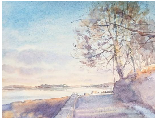
9. Rossleague walk, Great Island, Cork, Watercolour on paper, 28x21 cm, 2021 €350 Framed