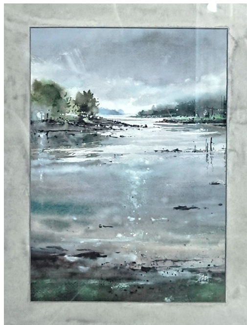
11. Low tide in Oysterhaven, Watercolour on paper 31x23 cm, Summer 2023 €320 Framed