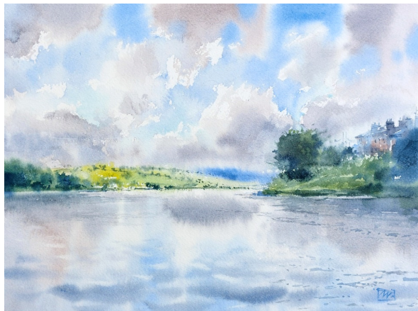
2. Lee at High Tide, Blackrock Pier, Cork (Plein air), Watercolour on paper, 31x23 cm, Summer 2023 €320 Framed