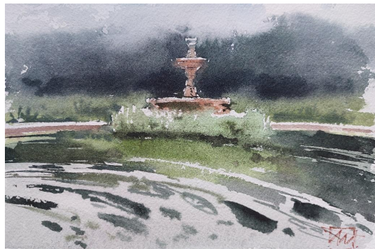
10. A calm evening at Fitzgerald Park, Cork (Plein air) Watercolour on paper 23x14.5cm, Summer 2023 €290 Framed