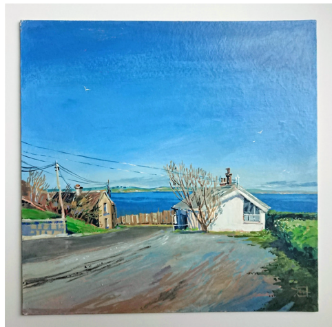
6. White house near Myrtleville, Gouache on cardboard, varnished 20x20cm, Spring 2022 €290 Framed